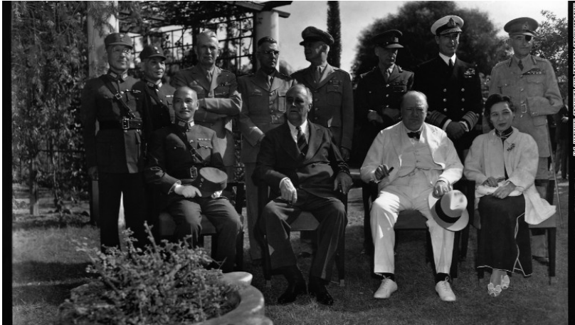
1943-American President Franklin Delano Roosevelt, British Prime Minister Winston Churchill and Chinese leader Chiang Kai-shek meet with other military leaders at the Cairo Conference.